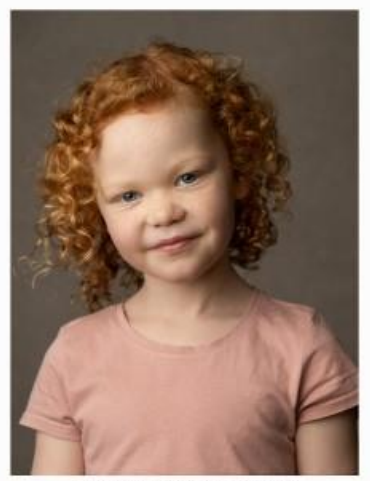
Basic headshot session