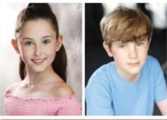
Over 500 Five 🖈 Google Reviews